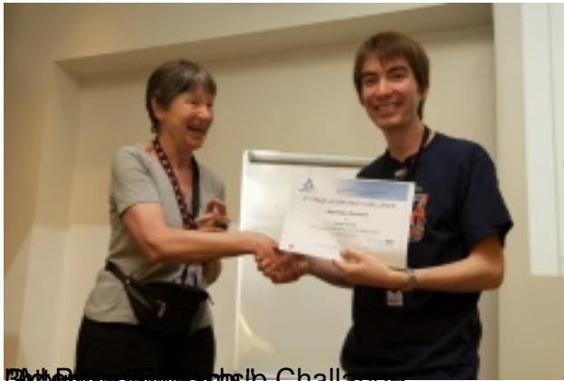
Path-Based Reasoning Challenge